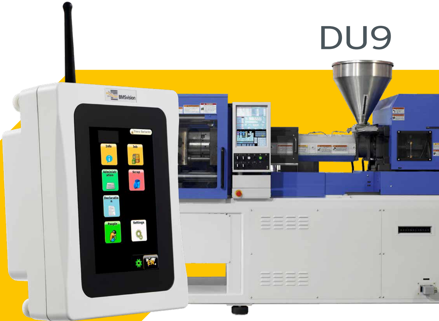
5" touch screen Data Unit