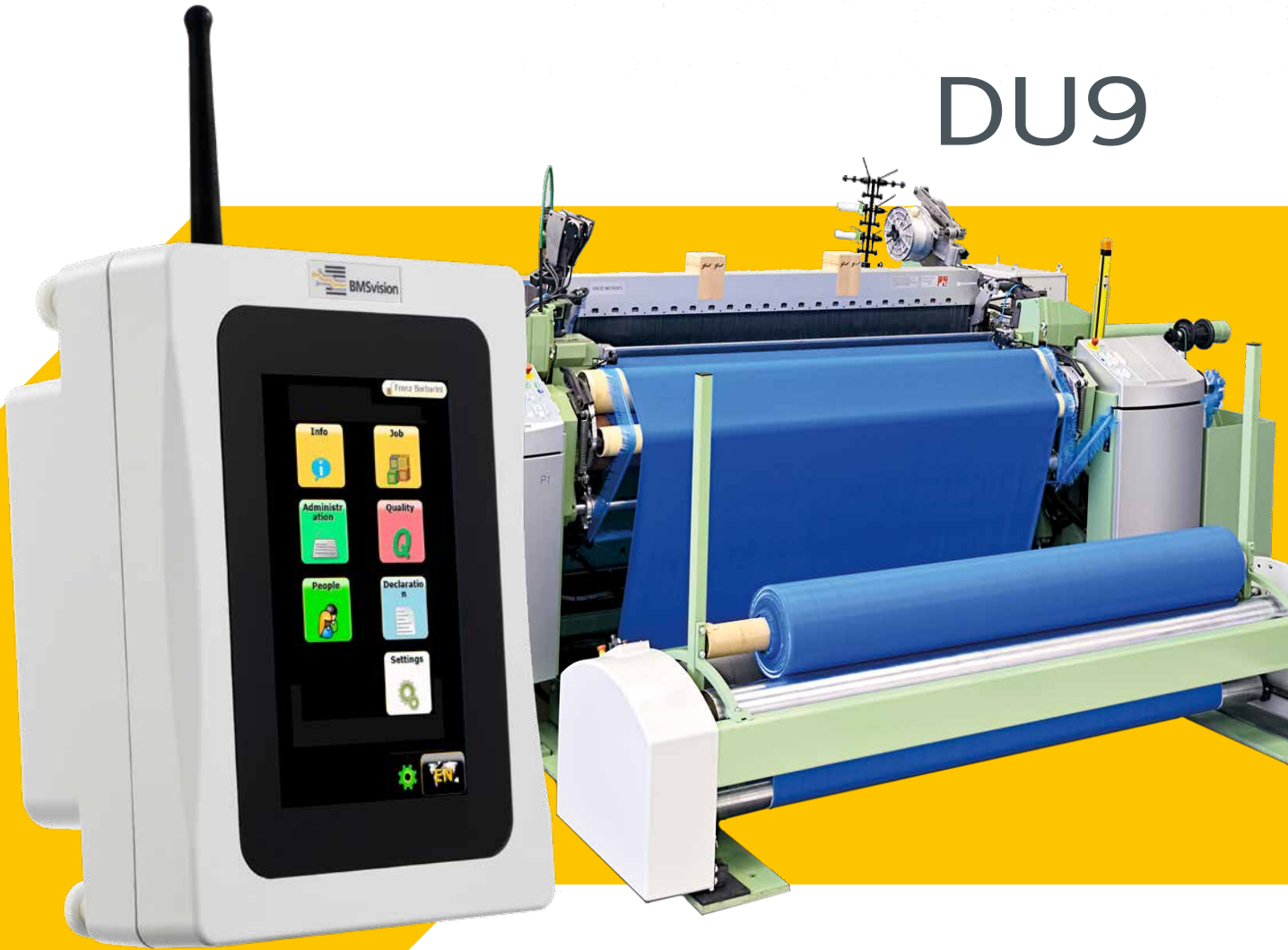
5" touch screen Data Unit